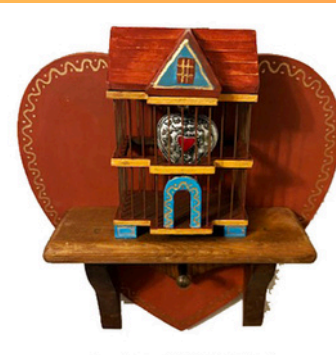
Ana Borne (2024 Edition)