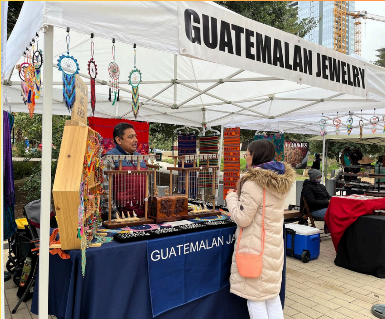
FridaFriday.ATX hosts markets throughout the year.