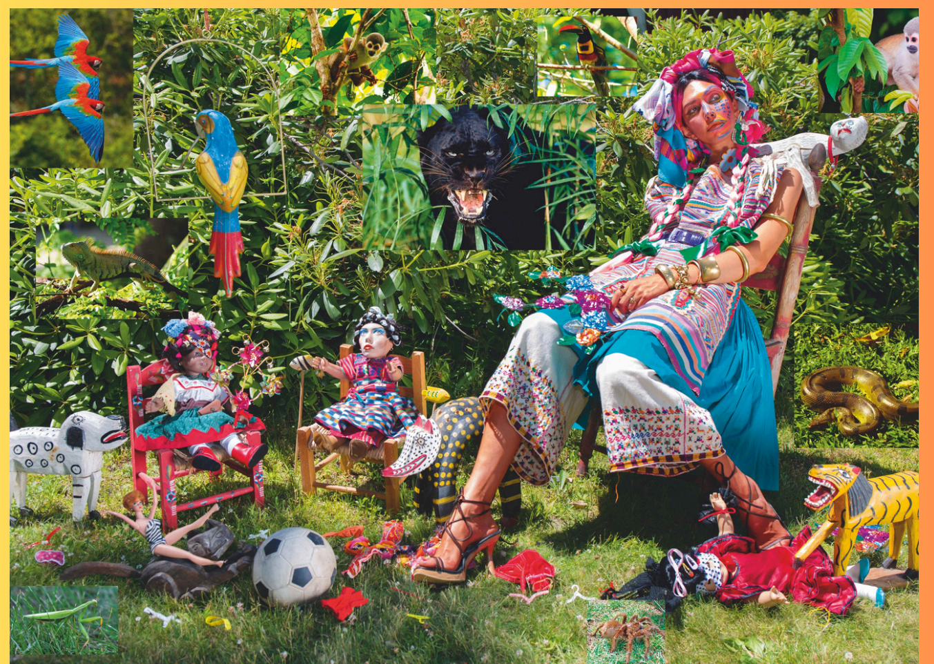
"Queer Rage," Artwork by Martine Gutierrez

The exhibit " Native America: In Translation " at the Blanton Museum of Art showcases a powerful collection of Native American art, curated by Wendy RedStar. This collection highlights the rich cultural heritage and diverse traditions of Indigenous peoples across North America. Catch this incredible collection before it closes on Jan. 5 and check the Blanton's website for dates, times, and prices for your visit.